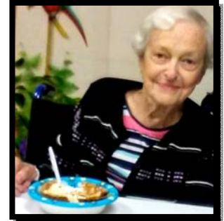
There's only one remedy for summer heat- ICE CREAM! Everyone enjoyed hot fudge sundaes, music, and movie clips from the movie, "Meet me in St. Louis."