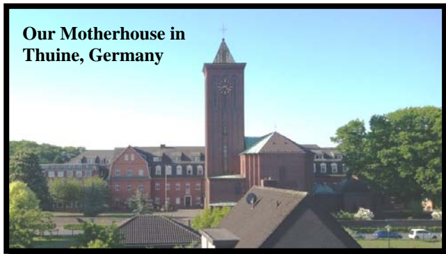
Our Motherhouse in Thuine, Germany

Reception is the day on which our Postulants of one year receive the Order's habit and white veil, and their Sister names. Now known as Novices, they spend two years studying and practicing living the vows; they study theology, human formation, deepen their prayer lives, and spend time in our various local apostolates (areas of work).