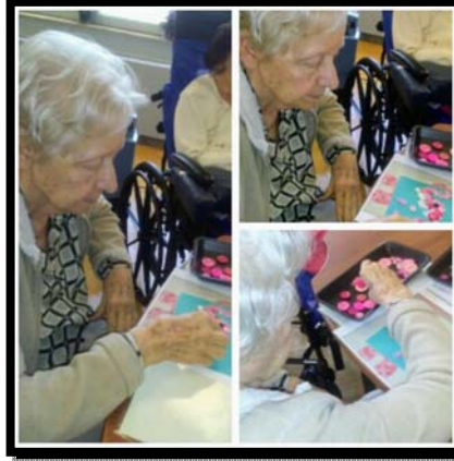
Working on fine motor skills, residents focus and create beautiful Button Art!